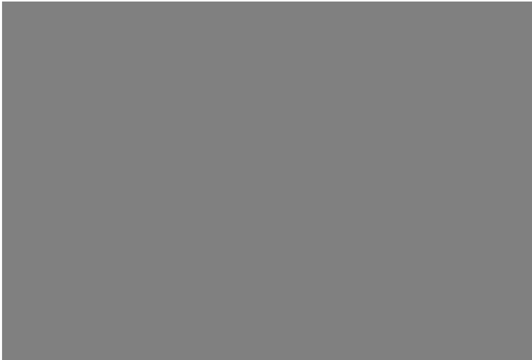
Figure 6- Ozone Cloud over Los Angeles

BEE++'s entire event processing system is encapsulated in a set of core base classes. From these, additional classes needed to support various aspects of dynamic analysis tool development can be derived. BEE++ provide the user with a prepackaged hierarchy of classes and the means to create customized classes through derivation from the appropriate base class(es). While this assumes knowledge of object-oriented design and how subclassing is implemented in C++, it is the most nonintrusive way to extend or modify the functionality of BEE++, since the components of the event processing model can be altered or replaced without modifying existing code. This avoids the recursive problem of debugging a user-customized analysis tool, in particular a debugger itself, because the user can assume that the class library is verified and validated. Configuration customizability allows the dynamic establishment of user-defined events with user-defined views that can be modified during execution.